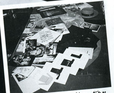
Articles for the Fan Club Auction