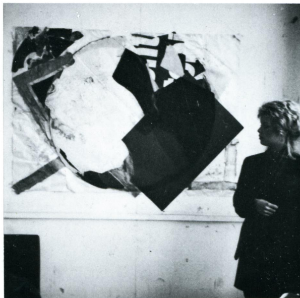
One of Kim's earlier Artistic Adventures – A Collage (we think).