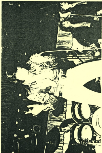
1974 - GUESS WHO.