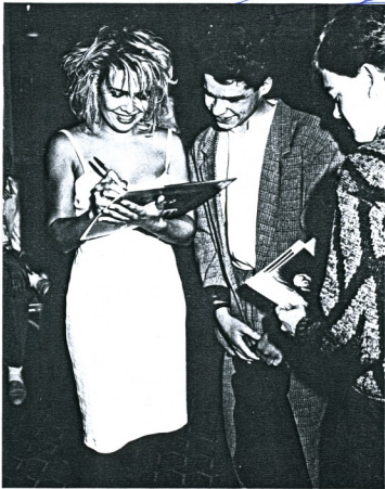
"ANOTHER SATISFIED FAN"