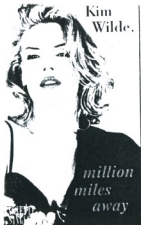
← Australian Million Miles Away Cassette Single