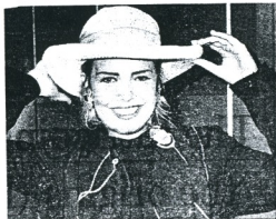
INGER Kim Wilde left Britain yesterday on a date with Michael Jackson.

The daughter of 50s British rock'n'roller Marty Wilde will be supporting act on the first show of the American superstar's European tour in Rome next Monday. She said before flying out of Heathrow: "It's going to be great. I've a new