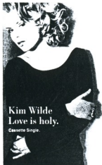
U.K. Love is Holy Cassette Single →