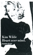
← U.K. Heart Over Mind Cassette Single